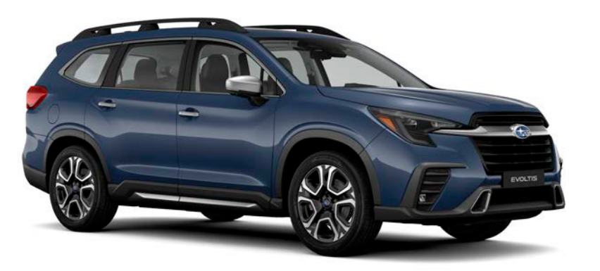
Cosmic Blue Pearl