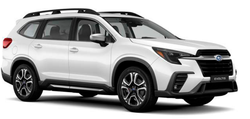
Crystal White Pearl